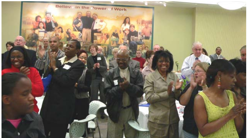
Friends and family applaud at a recent graduation ceremony of the 13 th Cashier Training Program held in mid-April. More than 200 people attended the event.

The students get a wide breadth of experience in the training setting which includes dealing with irate customers and processing orders in a timely fashion.