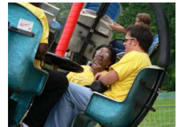
Job Corps Staff mix it up on tilt-a-whirl