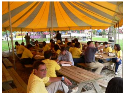
Wilmington Job Corps, a DWIB partner, recently held its 1 st Staff Celebration at the Brandywine Picnic Park.